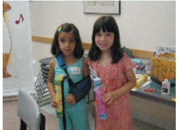
The girls show off the rainsticks they made in a Be Creative crafts class