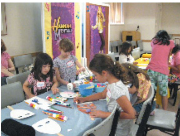
Children get creative during the mask-making craft.