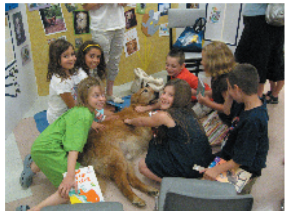
Children cuddle with Dante the pet therapy dog