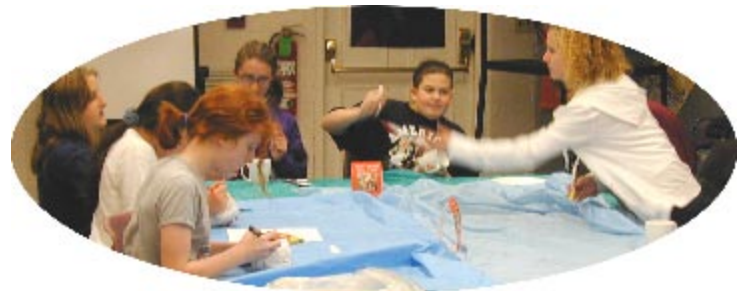
Teens enjoy crafts in the Baker After School Center

Aspiring writers in middle and high school are welcome to join this new group, which will meet monthly to put their stories to paper. Writers of all skill levels are welcome, and our next session will take place on Thursday, December 18 at 4:00 pm.