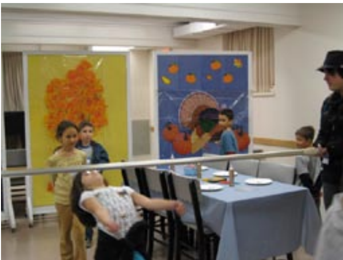
Children have fun doing the limbo at the recent music program at the library

Did you receive a Wii as a gift for the holidays? Do you need some tips on how to play? Do you want to see how the system works? Or would you just like to practice with some of our "experienced" teens? Whatever the reason, children ages 5-11 may register for a 30 minute session on Tuesday, December 30 from 2:30-5:00 pm. Registration will begin December 15.