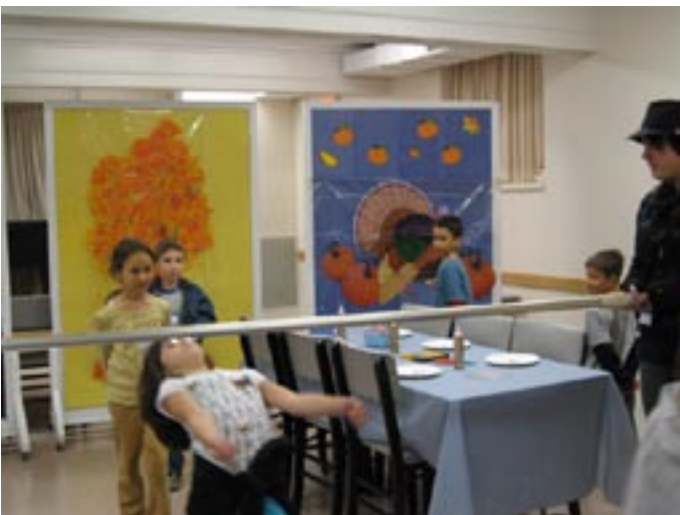
Children have fun doing the limbo at the recent music program at the library

Did you receive a Wii as a gift for the holidays? Do you need some tips on how to play? Do you want to see how the system works? Or would you just like to practice with some of our "experienced" teens? Whatever the reason, children ages 5-11 may register for a 30 minute session on Tuesday, December 30 from 2:30-5:00 pm. Registration will begin December 15.