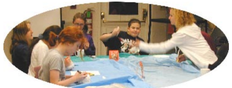
Teens enjoy crafts in the Baker After School Center

Aspiring writers in middle and high school are welcome to join this new group, which will meet monthly to put their stories to paper. Writers of all skill levels are welcome, and our next session will take place on Thursday, December 18 at 4:00 pm.