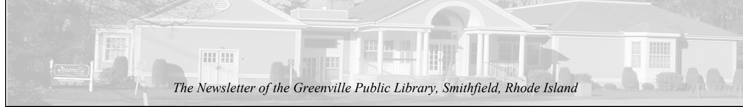
The Newsletter of the Greenville Public Library, Smithfield, Rhode Island

573 Putnam Pike, Greenville, RI 02828 / Phone: 401-949-3630 / Fax: 401-949-0530 / TDI: 1-800-745-5555 / www.yourlibrary.ws