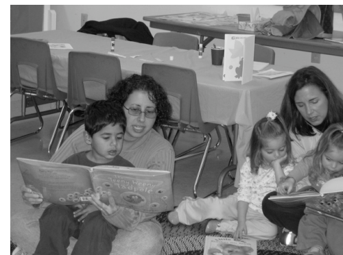
Sharing stories at Toddler Storyhour.