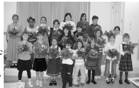
Children show off their creations.

arrangements will be on display at the Standard Flower Show at the RI Convention Center in February and each piece will be judged. Registration is now being taken. Children may pick up their arrangements at the library after the show.