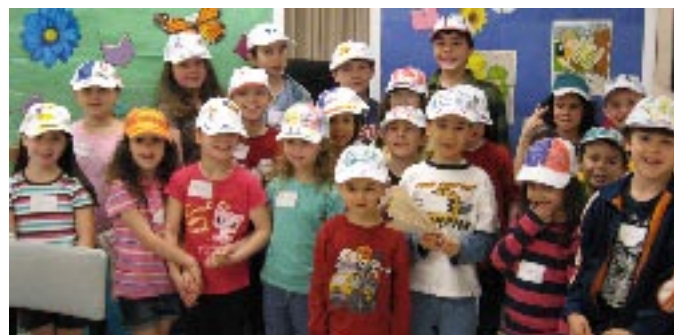
Children decorate caps in the Hats! Hats! Hats! program during school vacation week.

Children ages 6-10 may join the ladies of the Apple Blossom Garden Club to learn how to make a Mother's Day arrangement using fresh flowers on Wednesday, May 7 at 4:00 pm. Space is limited.