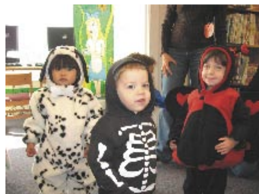
Toddlers dress for a Halloween storytime at the library.

The Bulletin boards and doorways in the Children's Room display artwork made by the children at the Greenville Nursery School. Visit the library to see how creative these young artists are!