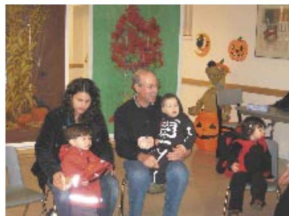
Tiny tots enjoy a pumpkin storytime during Turtle Time.

Children ages 5-10 may earn a free book simply by coming in to the Library during Children's Book Week, November 12-18, telling us what their favorite book is, and checking out a book to read. Catch up on those school assignments or just take out a fun book to read during Thanksgiving break. Children must show the librarian on duty in the Children's Room their library card and the book they are checking out to earn their free book. We will post a list of favorite books on our bulletin board!