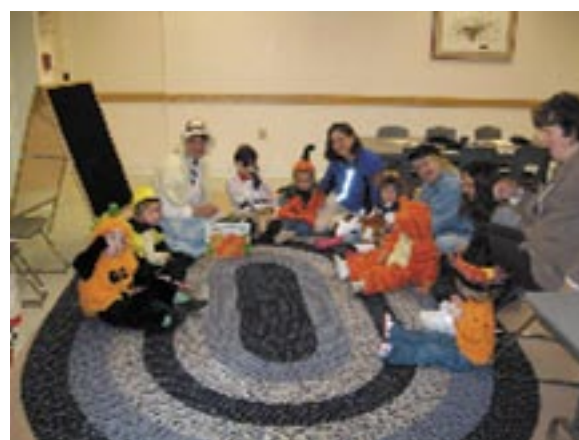
Turtle Time attendees enjoy dressing up for Halloween.