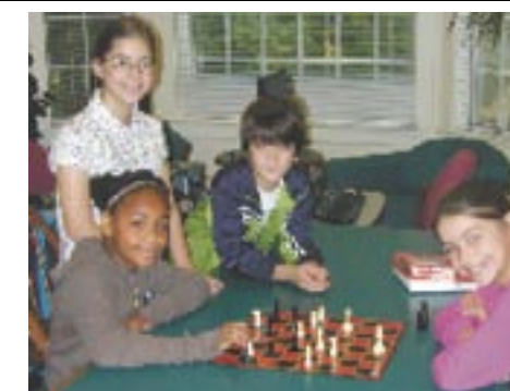
Members of the young adult Homeschooler's Club practice their chess acumen.

How much do you know about the Greenville Public Library and what it has to offer tweens and teens? Well, here is your chance to find out and win fabulous prizes in the process. There will be a fun Bingo tournament for those between the ages of 11 and 18 taking place at the library at 4:00 pm on Thursday, November 15.