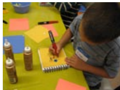
Children enjoy decorating their own notebooks and pencils

Join us on Wednesday, October 15, 2008 at 4 pm for pumpkin painting. Please bring a small to medium sized pumpkin and we will supply the decorating materials! Children ages 6-10 will be able to design and decorate their own pumpkin! Come and join the fun as we read a Halloween story and create a pumpkin to take home just in time for the season! Registration begins October 1.