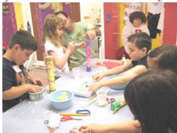
Children create Rain Sticks during a "Be Creative" craft class.