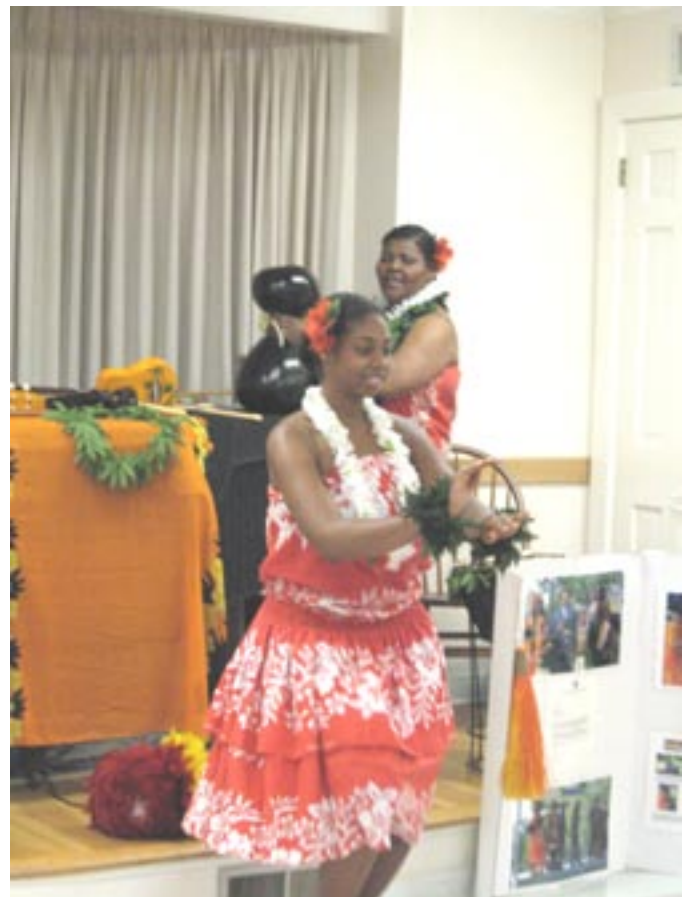
Napua 'O' Polynesia a dance troupe, demonstrate polynesian dancing.