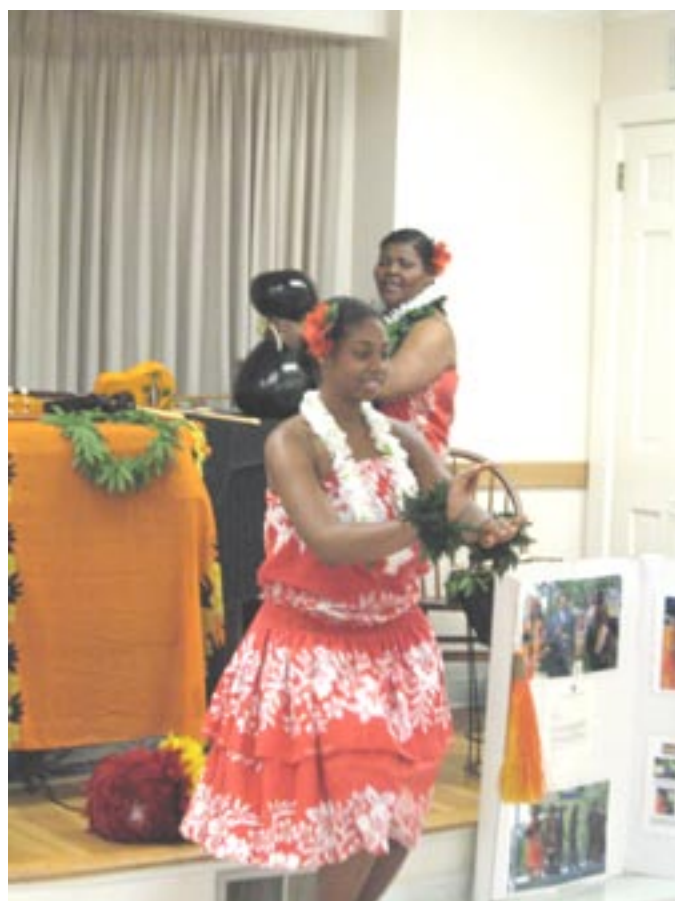
Napua 'O' Polynesia a dance troupe, demonstrate polynesian dancing.