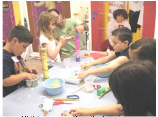
Children create Rain Sticks during a "Be Creative" craft class.