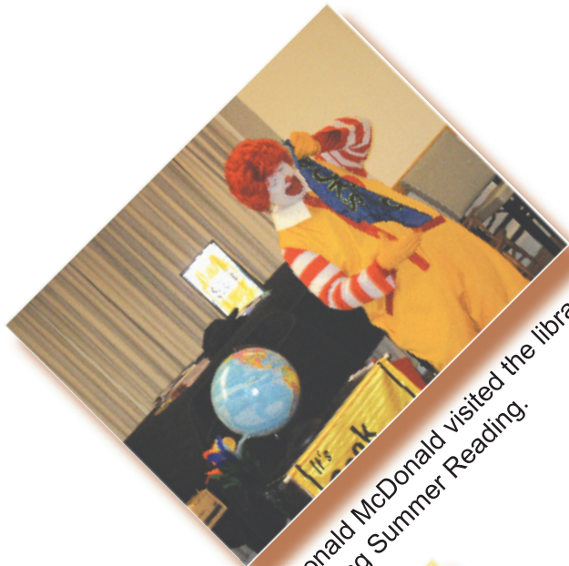
Ronald McDonald visited the library during Summer Reading.